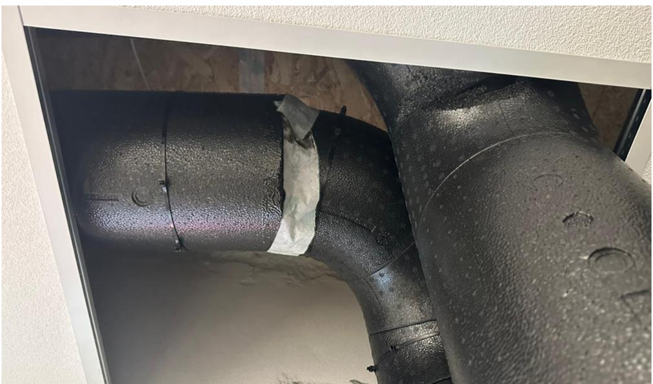
Figure 2 - Air leakage